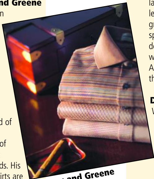
Fairway and Greene