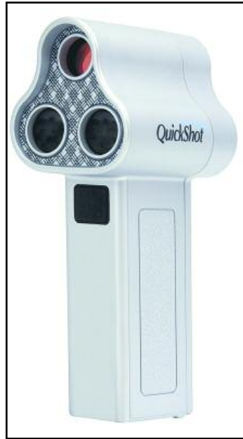
The Laser Link QuickShot™

speed up play and improve scores for the average player. My personal congratulations to both