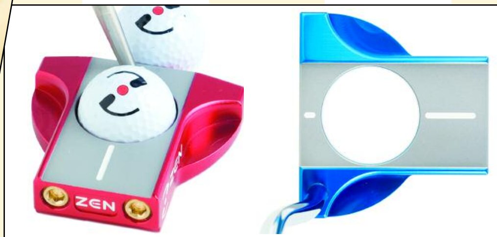
The Zen Oracle Tour Works Putter

Think you've seen everything? Nope—check this one out. This milled aluminum putter/training aid has a golf ball-sized cavity in the center of the mallet that allows you to swing through on your line, and as the head is lifted, the ball is released along the line you've swung. This, its creator Bob Hannington says gives instant feedback. The club also incorporates three separate weight ports—two in the rear and one on the underside, to create multiple weight configurations depending on the conditions. The weights can be setup unequally - creating the "toe hang" preferred by some professionals. Additionally, the shaft is bent into a unique configuration, which takes it out of the alignment picture. The putter comes standard with the Zen Oracle putting training system with a card set, manual and instructional video featuring instructor Rick Smith. Just $299.